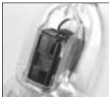
Wires should be routed as shown above.