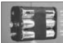
Tape batteries for rough play.

Reposition the battery pack until the cover goes on as a precision fit and sits easily and smoothly in the proper location.