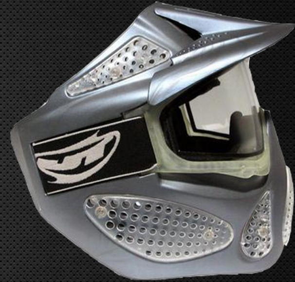
Steel w/ clear frame

The nForcer was released as a modified version of the Elite nVader. It was intended to provide the comfort of the Spectra frame combined with the larger protection area of the nVader. It was released a couple years after the nVader and to differentiate itself from it, it features clear vent guards, and came in a steel/clear variant not seen in the nVader. It's compatible with all of the Spectra accessories and was discontinued in 2009.