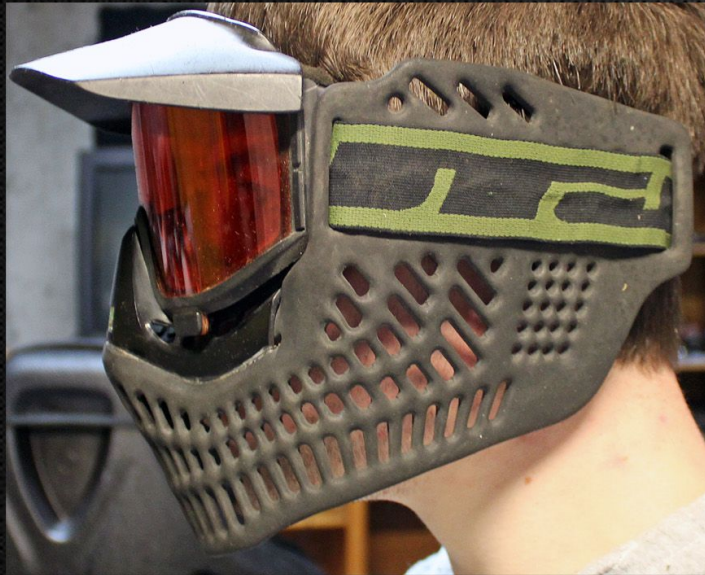
early foam bottoms