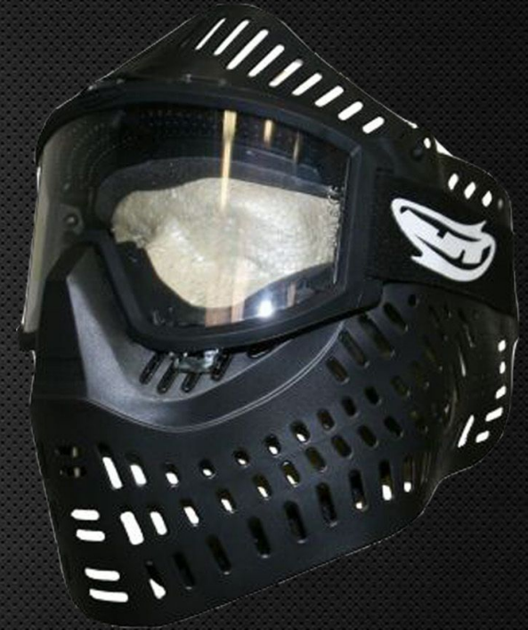
later plastic bottoms

The JT Softstream was JT's most basic paintball mask. It uses the Elite frames and features a removable forehead shield. Early masks from the 90's came with a foam bottom face plate. Late 90's versions came with a rubber bottom similar to the Flex, and last models were hard plastic. The mask came only with a basic strap, and a single pane lens. This mask came with many Starter kits from Brass Eagle, Viewloader, and JT. It was also available in Olive.