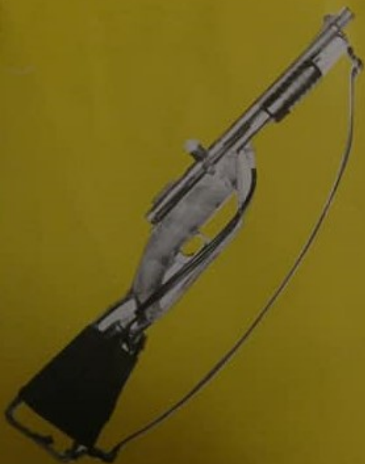
"PAINTER" optional sniper stock shown

"QuikSilver" quick change or CA system adapter Direct Feed with loader Performance Tuning Ball feed control - InstaPierce