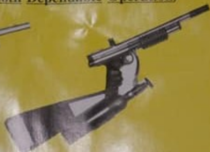
Typhoon Calif. or Lower Bottle Style Basic $550.00