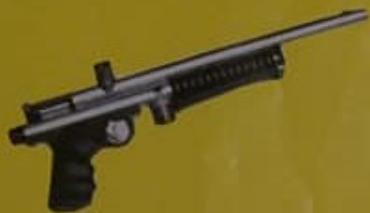
Typhoon - Vertical Bottle Basic $480.00

ADVANCED PNEUMATIC AUTOMATION (Smooth Dependable Operation)