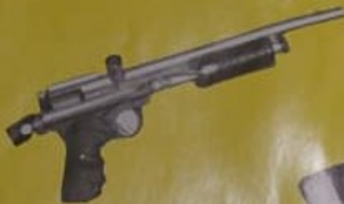
Typhoon - Back Bottle Basic $508.00 Dual Bottle - $560.00