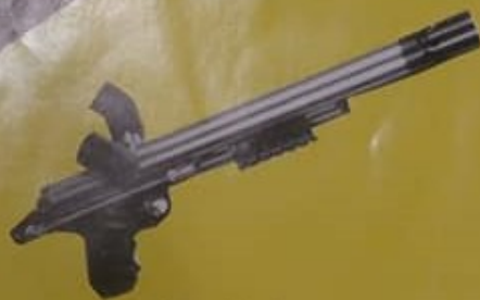
Nasty Typhoon Basic $695.00

EACH PALMER SEMI IS PRECISION CRAFTED TO EXACTING STANDARDS then INDIVIDUALLY TUNED & TESTED TO INSURE OPTIMUM PERFORMANCE