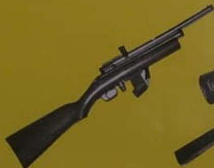
Hurricane Basic $669.00